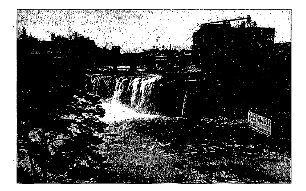
UPPER FALLS OF THE GENESEE RIVER ONE OF THE THREE FALLS IN THE HEART OF THE CITY