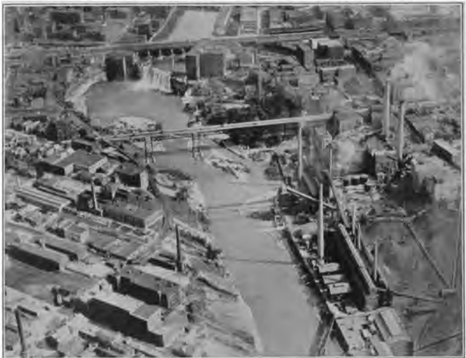
PART OF INDUSTRIAL ROCHESTER