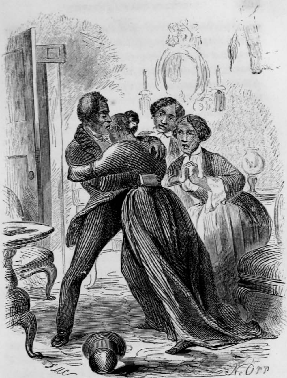
ARRIVAL HOME, AND FIRST MEETING WITH HIS WIFE AND CHILDREN