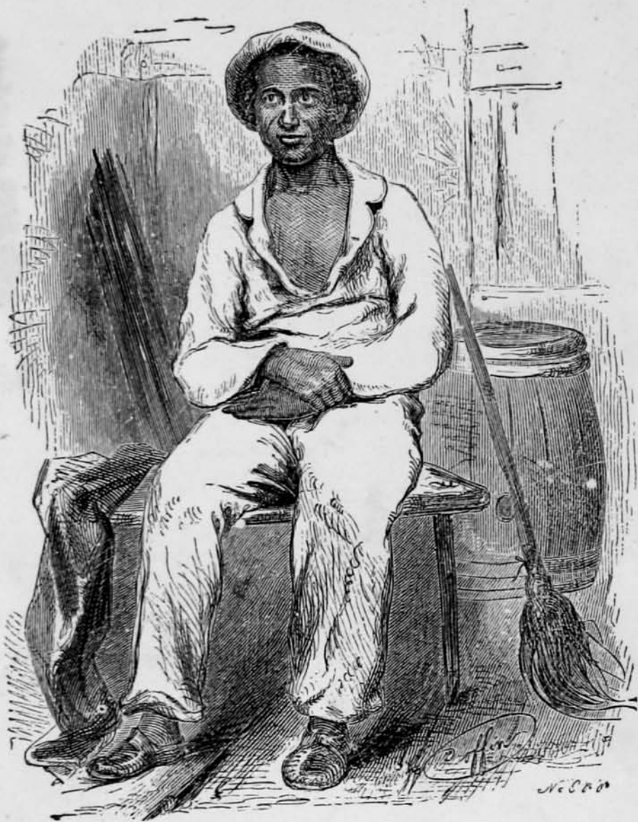
SOLOMON IN HIS PLANTATION SUIT.