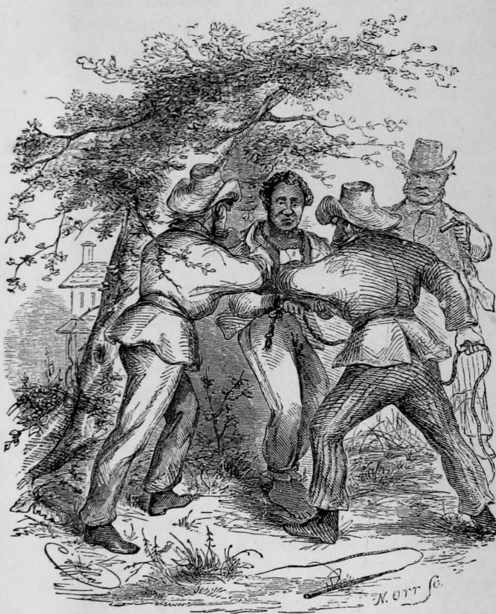
CHAPIN RESCUES SOLOMON FROM HANGING.