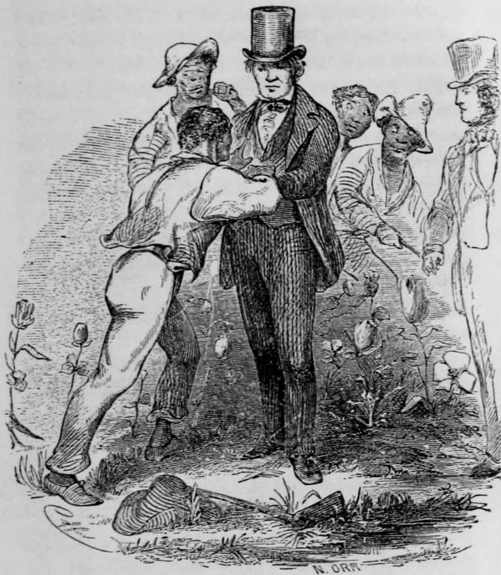
SCENE IN THE COTTON FIELD, SOLOMON DELIVERED UP.