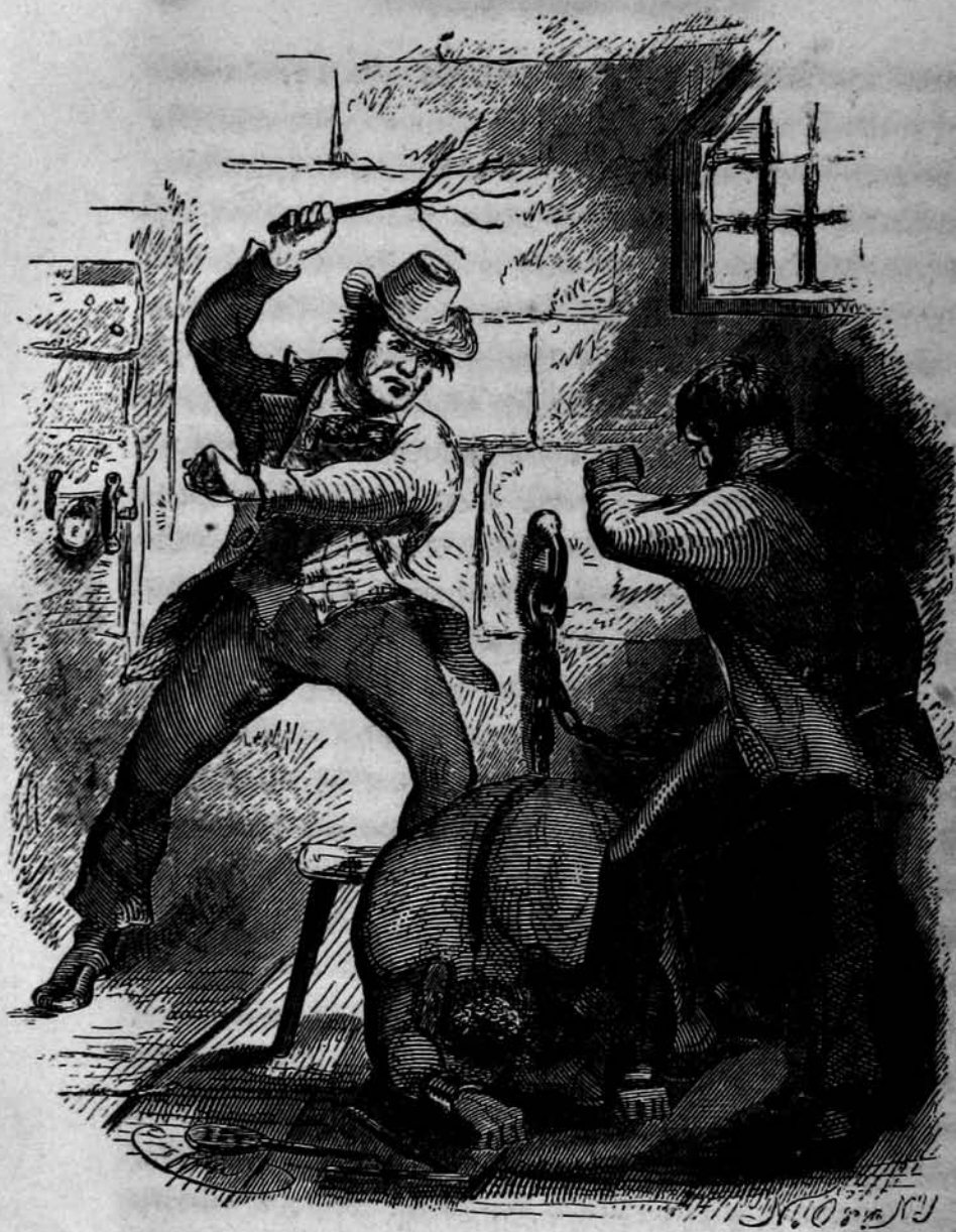
SCENE IN THE SLAVE PEN AT WASHINGTON