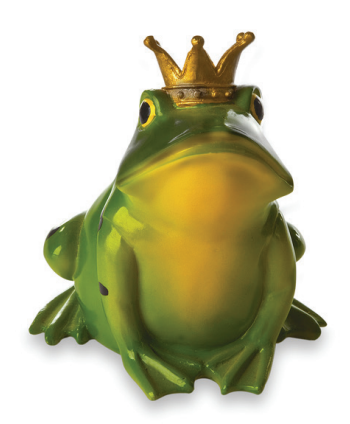
Prepared by the Adult Services Librarians of Monroe County 2017